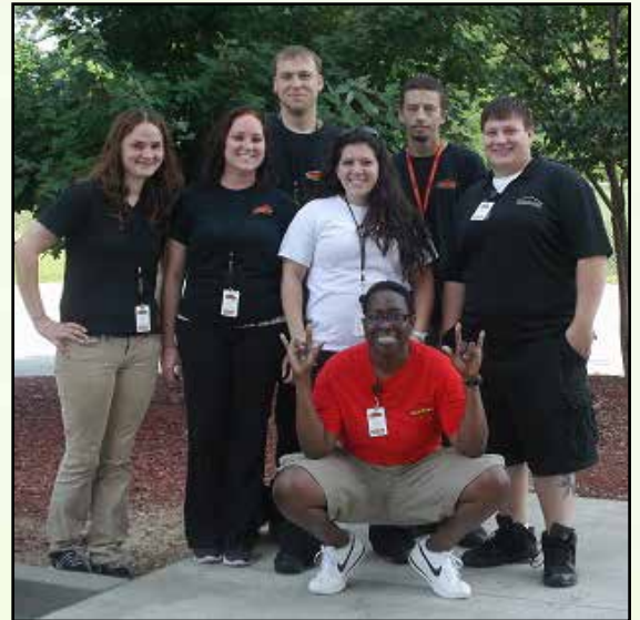
MACON SOUTH, GA